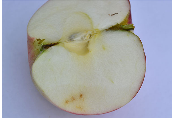
Apple maggot damage, early stages