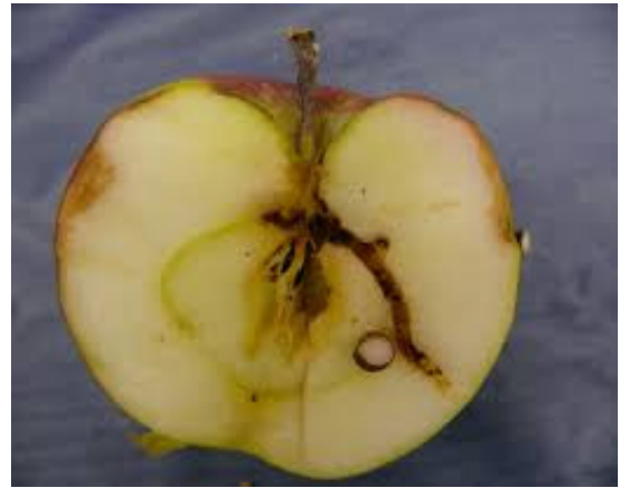
Codling moth damage